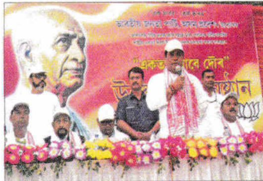
Chief Minister Sarbananda Sonowal at the 'Rashtriya Ekta Diwas: A Run for Unity' programme, at the Jntool field in Guwahati on Tuesday.

birth anniversary of the Iron Man of India — Sardar Vallabhbhai Patel today.